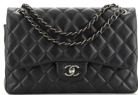
4. Chanel Classic Double Flap Bag Quilted Caviar Jumbo