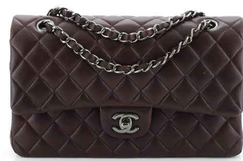
3. Chanel Vintage Classic Double Flap Bag Quilted Lambskin Medium