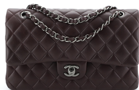
2. Chanel Vintage Classic Double Flap Bag Quilted Lambskin Medium