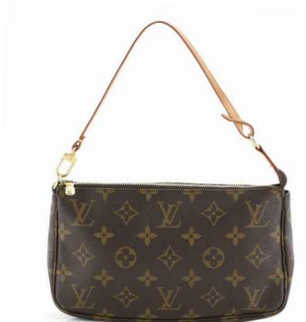
5. Louis Vuitton Pochette Accessoires Monogram Canvas