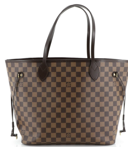
4. Louis Vuitton Neverfull Tote Damier MM