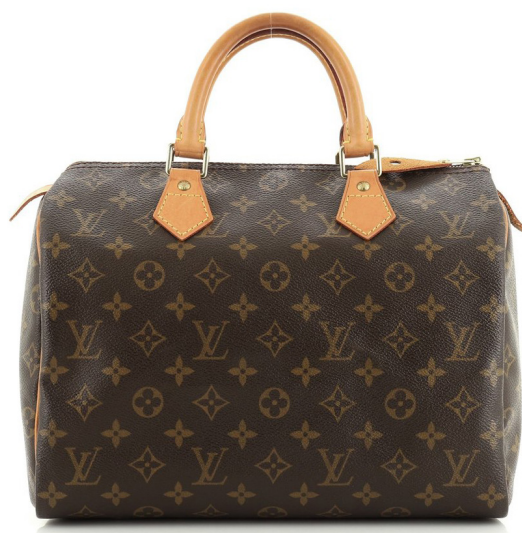
2. Louis Vuitton Speedy Handbag Monogram Canvas 30