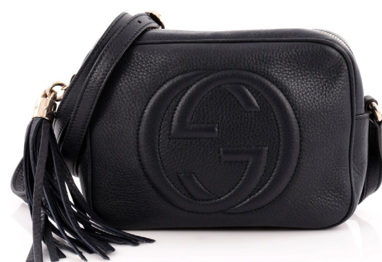
3. Gucci Soho Disco Crossbody Bag Leather Small