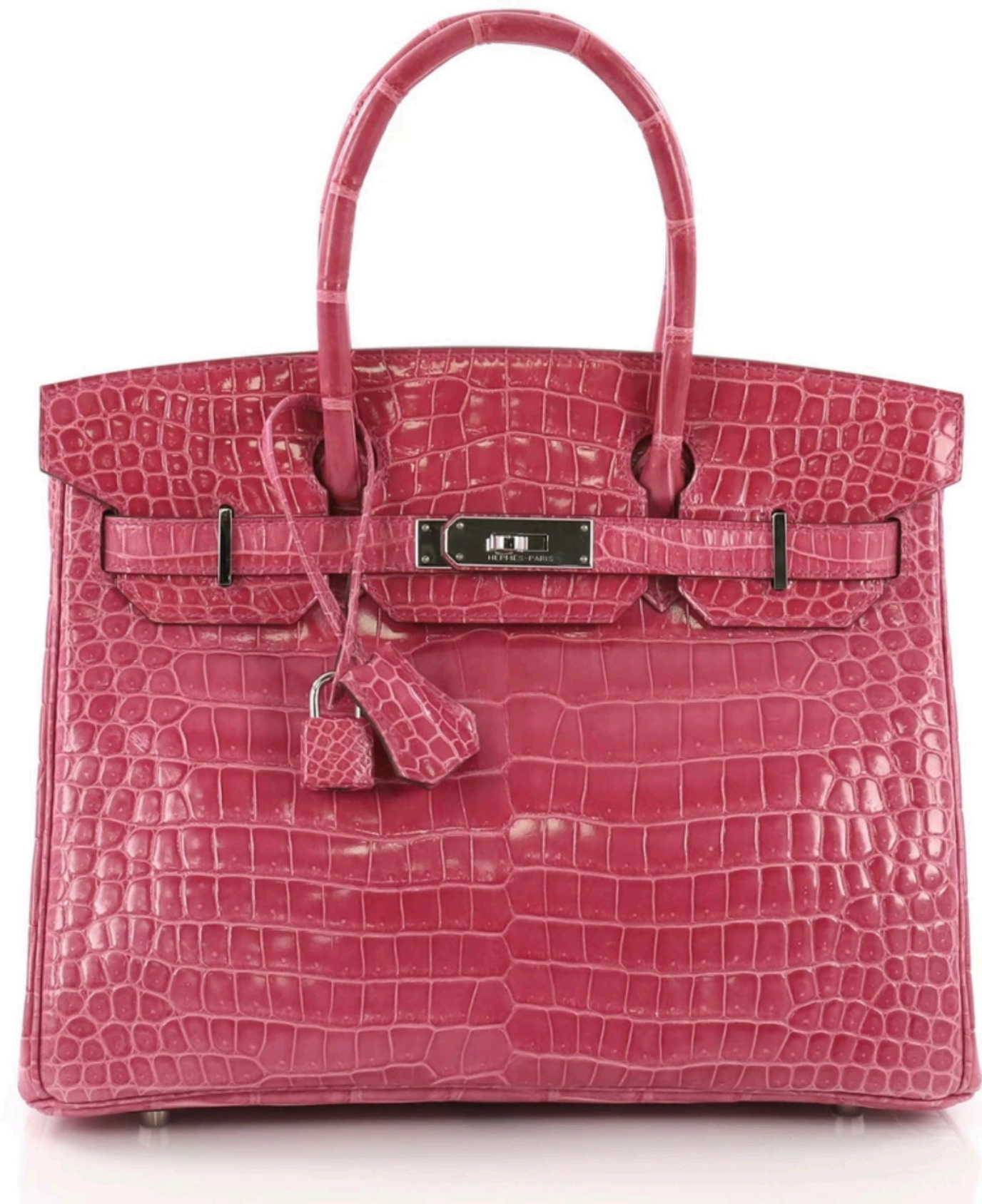
Hermès Birkin Handbag Fuchsia Shiny Porosus Crocodile with Palladium Hardware 30