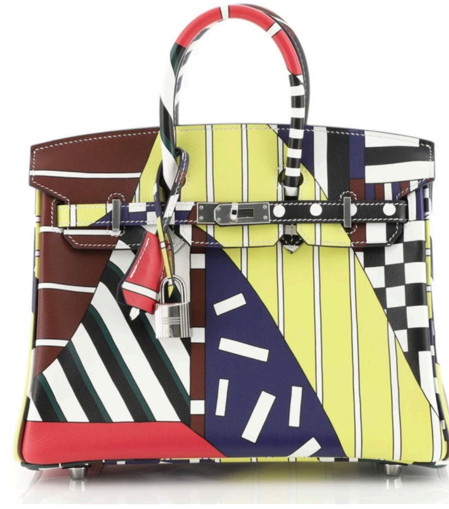
Hermès One Two Three and Away We Go Birkin Bag Limited Edition Printed Swift 25