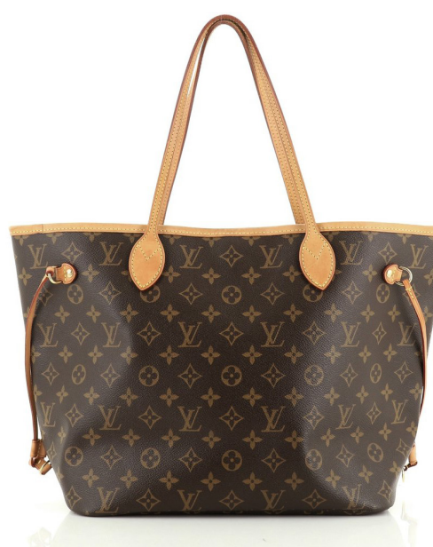
5. Louis Vuitton Neverfull Tote Monogram Canvas MM